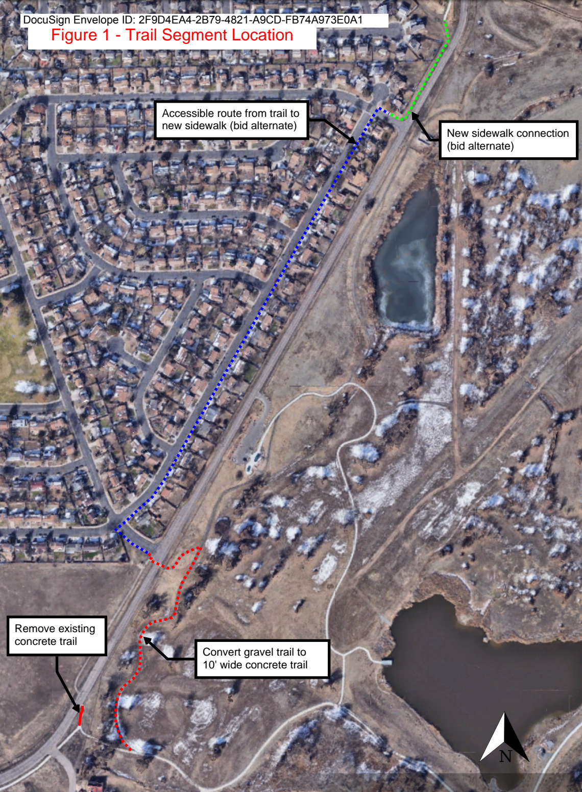
Figure 1 - Trail Segment Location

Accessible route from trail to new sidewalk (bid alternate)